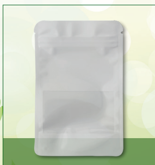
PP monomaterial stand-up pouch with zipper

Produced from OPP/OPP s /CPP in material thickness of 20/16/75 µm. The pouch with optional window is reclosable and also suitable for hot fill applications.