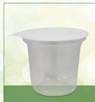
PP monomaterial laminate for cups (blank)

The recyclable transparent mono-material OPP s /CPP laminate with a material thickness of 16/110 µm can be produced with and without spout. It has good drop test resistance and can even be used for hot filling.