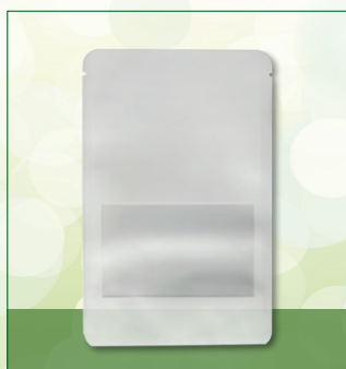
PE monomaterial stand-up pouch with/without zipper

Produced from OPP/OPP s /CPP in material thickness of 20/16/75 µm. The pouch with optional window is reclosable and also suitable for hot fill applications.