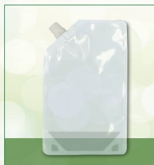
PP monomaterial stand-up pouch with/without spout

The stand-up pouch with window as an option, is made of HDPE s /PE in a material thickness of 32/100 µm. It has a high oxygen barrier and can be resealed with a zipper.